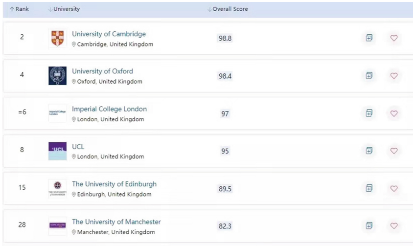
Fig. 2. World rankings of British universities