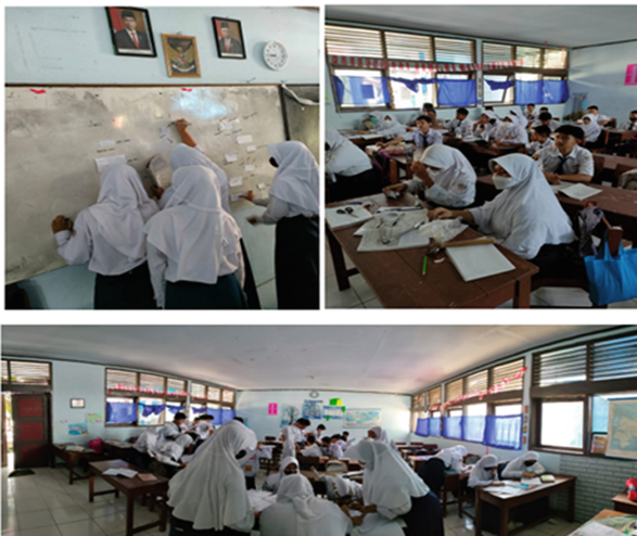
Fig. 5. Teaching and Learning Activities in Cycle I (Meeting 2)

The teacher gave the students the freedom to explore the given application by providing video tutorials. The test results in cycle 1 showed an increase in learning outcomes.