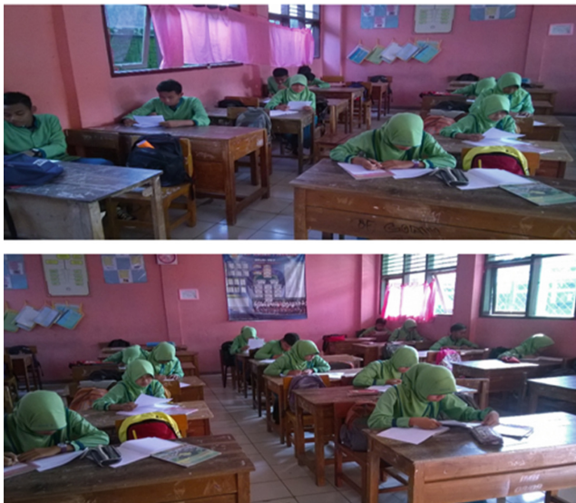
Fig. 3. Pre-Test Activities

worksheets to students. The teacher asks the students to read the given challenges by paying attention to the limitations in the students' worksheet. Students find it difficult to find x_1 and x_2 . The teacher provided guidance, students must be able to imagine with the help of the content in the video shows in class (Fig. 4).