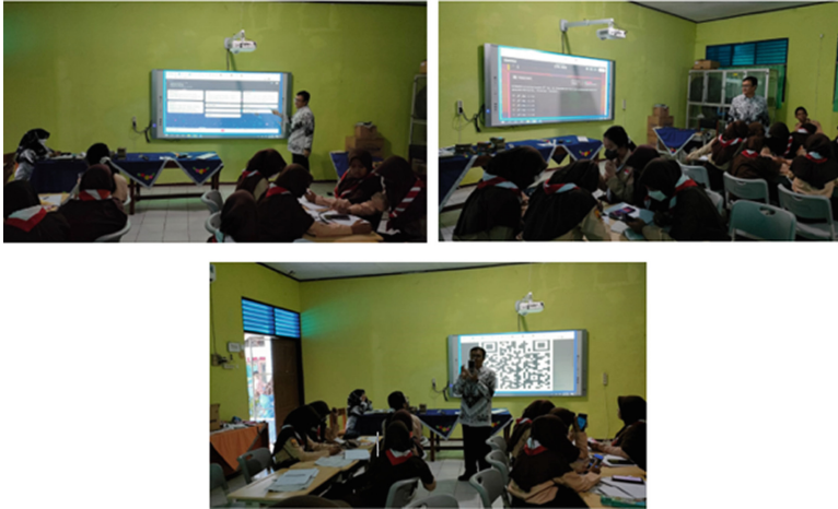
Fig. 4. Teaching and Learning Activities in Cycle I (Meeting 1)

In the core activity the teacher explained about finding the value of the axis of symmetry and the optimum values. The teacher introduced the students to existing applications in learning. Students in groups start to try the application to form the value of x_1 and value of x_2 . Children felt very happy to learn by using the media, given application and props. They enjoyed it so much that even during break time they did not want to leave class and continued to do the task. There were even groups that work by looking for sketches (Fig. 5).