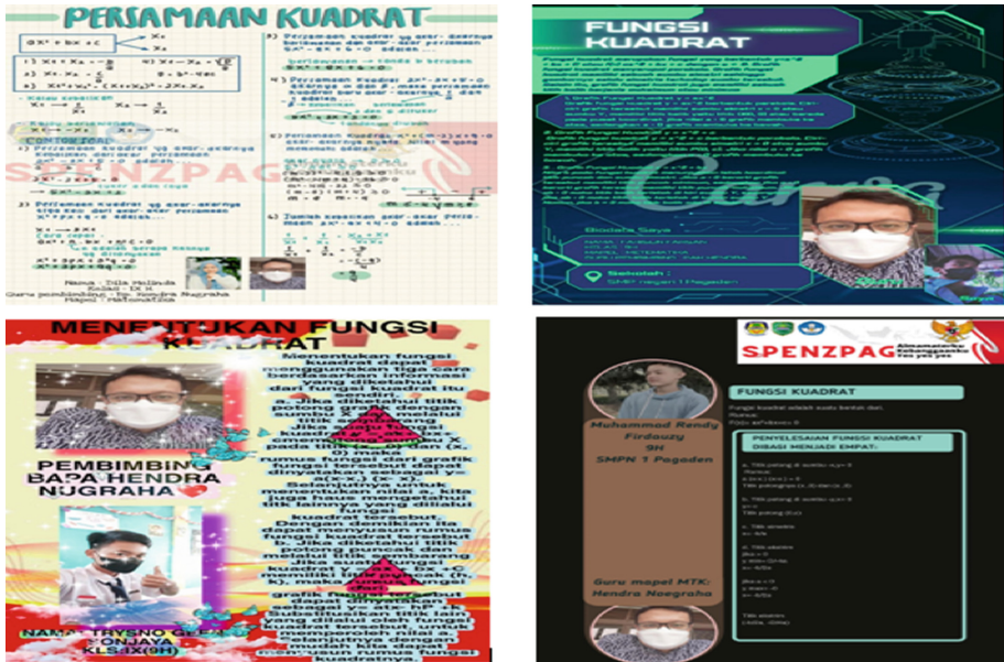
Fig. 6. Student resume literacy that will be uploaded on the Gate Cita application

In cycle 2 there are two children whose scores are still below the minimum completeness criteria of 70. For children whose grades are below the required minimum, remedial teaching is held after school. In cycle 2, the performance indicators have reached, namely 87.5% of students have scored above or equal to the KBM. Hence, the research was stopped and declared successful (Table 3).