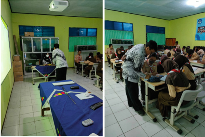
Fig. 2. Coordination with the research team and preparing the students