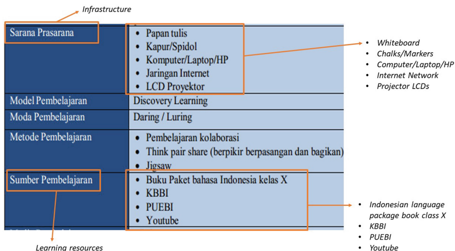
Fig. 14. Means and Sources