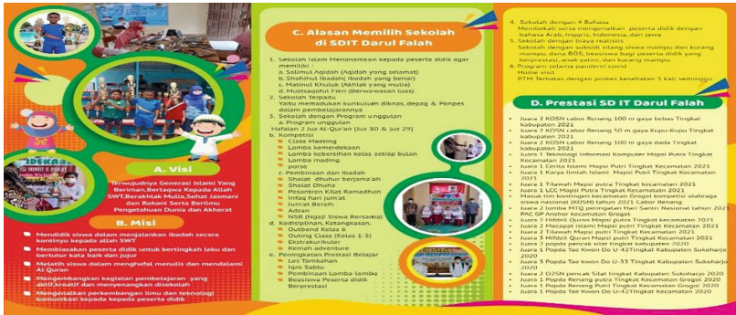
Fig. 2. Pamflet of SDIT Darul Falah

the attractiveness of SDIT Darul Falah in influencing parents' interest in sending their children to Islamic-based schools lies in the vision and mission of the school, religious programs, and achievements achieved by the school. This research is in line with previous research conducted by Sunarya et al., (2016) At SMK Islamic Village Karawaci, the results were obtained that the school has an attraction shown in its facilities, vision and mission with the help of a video profile.