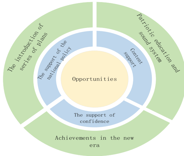
Fig. 2. Analysis of the opportunity of the impact on college students' patriotic education

of China and the State Council issued and implemented the “Outline for the Implementation of Patriotic Education in the New Era” (hereinafter referred to as the “Outline”), which is a programmatic document to strengthen patriotic education in the new era. The system has answered the fundamental questions of “why to be patriotic, how to be patriotic, and how to be patriotic”, further strengthening the cultural confidence of the entire party and society, reflecting our party’s mission and consciousness. At the same time, the introduction of the policy also pointed out the direction. The state provides policy support for patriotic education among college students through the introduction of a series of programs.