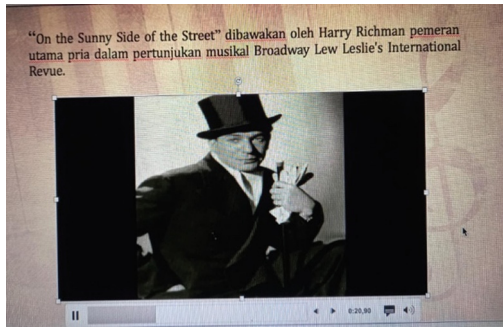
Fig. 3. Sample of Power Point Containing Audio and Video.

students to know more about the object of the music itself as well its history. Playing the video will also give students a musical experience in learning music history.