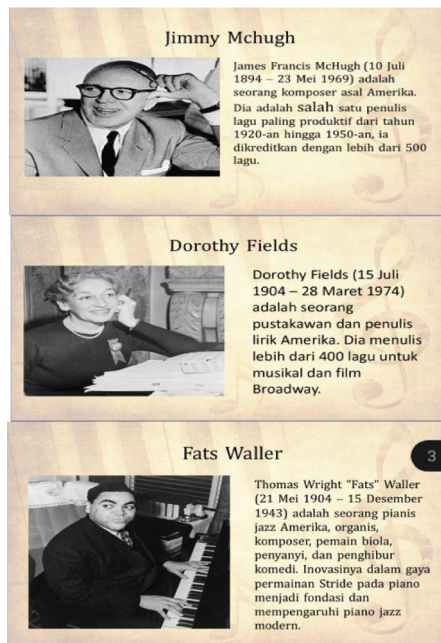
Fig. 2. Sample of Power Point Containing Photo and Biography.

In the last slide (Fig. 3), teachers are aided in presenting the video that includes the original audio of the song that is currently being discussed and taught. This will help