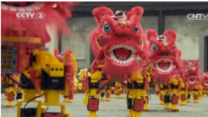
Fig. 3. Jimu "lion" modeling machine appeared on CCTV

For better suggestions on the digital dissemination of Lingnan Lion Waking culture, we have undertaken a comprehensive analysis of the three main topics. The dominant theme comprising 50.8% of the news, “Conservation, Inheritance, and Innovation”, reveals the multi-dimensional facets of Lingnan Lion Waking culture. The protection of ICH emphasizes foundational roots and tradition, while seamlessly integrating innovation to ensure its relevance in modern society. The development of Lingnan Lion Waking has been primarily achieved through industrialization, with enterprises providing technical and financial support. At the same time, the cultural and tourism industries offer avenues for growth, collectively driving the digital dissemination of Lingnan Lion Waking. For example, in 2017, "lion robot" from Guangdong danced in a CCTV special program (as shown in Figure 3), sending auspicious wishes for the New Year to audiences across the country, and harvesting the audience's praise 10 .