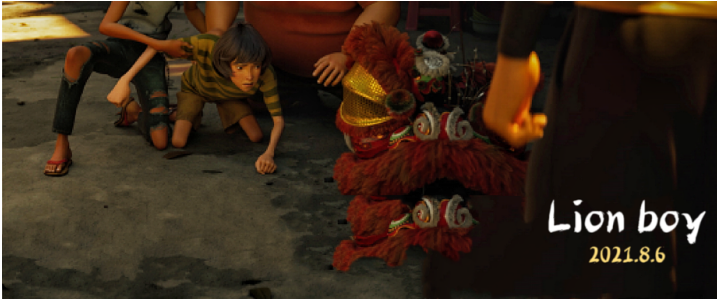
Fig. 4. The animation film "Lion Boy"

In the theme of “Competition and Performances” (accounting for 23.6%), the enduring charm of Lingnan Lion Waking is showcased through traditional festive events. At the same time, the collective memory established by societal groups about Guangdong Lingnan Lion Waking prompts people to embrace Lingnan Lion Waking from their psychological, attitudinal, and behavioral perspectives. Particularly in recent years, some Lingnan Lion Waking competitions have been held through online showcases, transcending temporal and spatial boundaries and earning widespread acclaim.