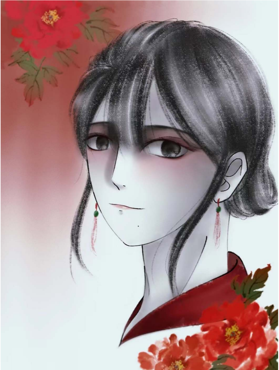
Fig. 1. (Fusang drawn by myself)