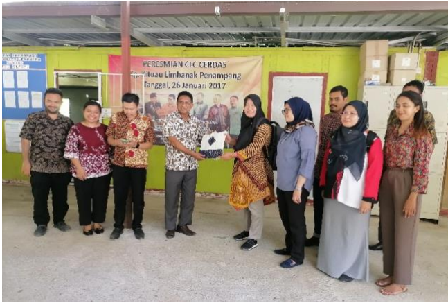
Figure 3.0 Visiting Community Learning Centre Cerdas, Penampang

Despite the establishment of CLC Cerdas was in 2017, the study found that the learning centre has been established earlier than the stated year. According to the learning centre's principal, this particular learning centre was established since 2010 with the partnership of religious entity from Catholic Church as the principal was known as Ketua Katolik Indonesia. At the early stage of opening, the learning centre rented several rooms at Secretariat Cathedral building for 7 years before it moved to a new rental outside the said building.