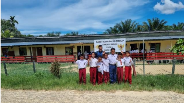
Figure 4.0 Visiting Community Learning Centre Ladang Mawau, Beaufort

of PMI as a Corporate Social Responsibility (CSR) initiative. Oil palm plantation companies mostly contribute to provide educational infrastructure as well as collaborating with Guru Bina and Consulate General to recruit local teachers or also known as Guru Pamong [16].