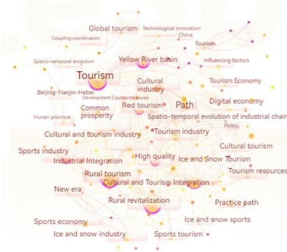
Fig. 2. Co-occurrence of keywords of high-quality tourism development research

In CiteSpace, take "Keyword" as the running node type to obtain co-occurrence network map of high-quality tourism development keywords, marked as Figure 2. The co-occurrence network graph unveils a tapestry of 192 nodes interlinked by 279 connections, with a network density of 0.0152. This alludes to the presence of numerous interrelations among the keywords within the realm of high-quality tourism development research, yet the aggregate connectivity is not characterized by an intimate proximity.