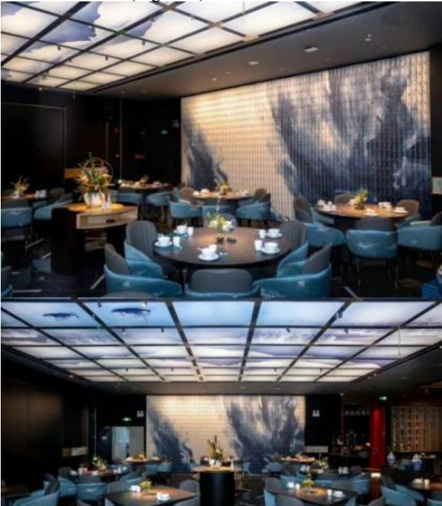
Fig. 4. a restaurant space interface.( Image source: Xiaohongshu.com)

Interior space design is a comprehensive spatial form composed of multiple spaces with different attributes. The design of spatial interfaces directly influences the overall atmosphere. The ceiling, floor, walls, and partitions divide the space and define its boundaries. The height of the ceiling is a key factor, as high ceilings give a sense of spaciousness, while low ceilings create a sense of security and a cozy atmosphere. Blue and white porcelain artistic patterns can be used to adjust the spatial perception, and different patterns can be applied to ceiling design. For example, diamond patterns from blue and white patterns can be used in the reception room, while representative patterns can be painted on the ceiling of private rooms to create an elegant atmosphere. The floor bears many elements such as dining tables, chairs, and equipment, and it needs to be designed to achieve a comfortable and harmonious effect. Petal patterns from blue and white porcelain artistic patterns can be used as markers for area division. "Walls and partitions are key factors determining the level of spatial connection, and the design should be based on different needs." The combination of blue and white porcelain artistic patterns with wall design adds vitality to the space. Special shapes and styles can be applied to the design of decorative wall interfaces to enhance the spatial three-dimensionality and aesthetics [6] . (Figure 4)