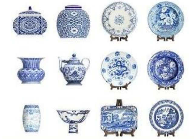
Fig. 1. various categories of blue and white porcelain.