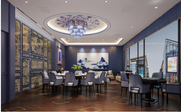
Fig. 7. the color design of the private room.

The expression of blue and white in this restaurant is not limited to walls and artworks. Even the details such as tables, chairs, and utensils are filled with elements of blue and white. The blue and white patterns on the tablecloth and the blue and white porcelain patterns on the utensils showcase a unique beauty. Blue represents tranquility and depth, while white symbolizes purity and freshness. The combination of the two makes the entire space more harmonious and comfortable. The expression of blue and white color is fully displayed in the blue and white porcelain-themed restaurant. Whether it's the murals on the walls or the decorations in the public areas and private rooms, the combination of blue and white gives the space a unique charm. Dining here, one can feel a different aesthetic enjoyment, a serene and elegant atmosphere. The expression of blue and white color makes people feel like they are in a scroll of blue and white porcelain, experiencing the unique charm of Eastern aesthetics(Figure 7).