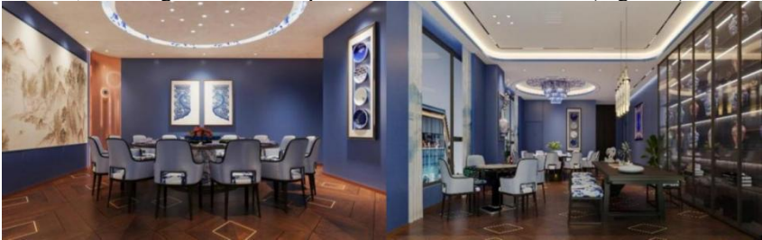
Fig. 9. display of soft furnishing.

"The expression of blue and white porcelain soft furnishings is not only a tribute to traditional culture but also a pursuit of beauty and innovation [10] ". With its unique form of expression, it combines ancient blue and white porcelain art with modern life, showcasing a different kind of beauty. In this restaurant, people not only taste delicious food but also immerse themselves in a cultural atmosphere, feeling the fusion of art and life. The expression of blue and white porcelain soft furnishings, with its unique charm and elegant temperament, brings a different aesthetic enjoyment to people. It allows us to reevaluate the value of traditional culture and feel the allure of ancient art [11-12] . In this restaurant filled with blue and white porcelain aesthetics, people can indulge in delicious food while also experiencing the accumulation and heritage of culture. The expression of blue and white porcelain soft furnishings takes us into a unique and mysterious world, allowing us to feel the perfect fusion of art and life. (Figure 9).