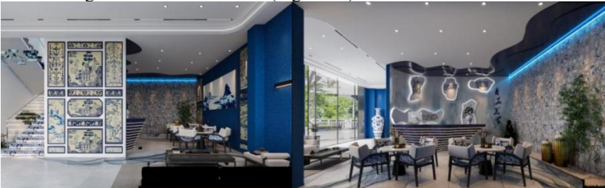
Fig. 11. Recycling of ceramic tiles on the water curtain wall and staircase floor.

The design of the water feature wall fabric and staircase floor is truly astonishing. The shattered blue and white porcelain pieces are skillfully embedded in the wall fabric and floor, forming unique patterns and textures. The delicate art of blue and white porcelain painting is displayed in these shattered pieces, as if a series of beautiful scroll paintings unfold before your eyes. The design of the water feature wall fabric and staircase floor not only adds artistic sense to the space, but also allows people to feel the profound cultural heritage of traditional culture. (Figure 11)