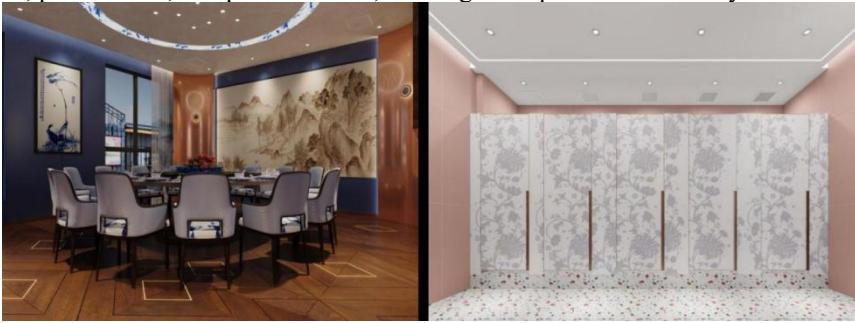
Fig. 6. private room and toilet pattern design. (Image source: drawn by the author)

In the blue and white porcelain-themed aesthetic restaurant, references to blue and white colors and pattern decorations are found everywhere, like exquisite paintings that adorn the entire space like poetry and paintings. Various patterns such as flowers and birds, animal patterns, dragon patterns, and landscapes are displayed on lamps, doors, walls, public areas, and private rooms, creating a unique sense of beauty.