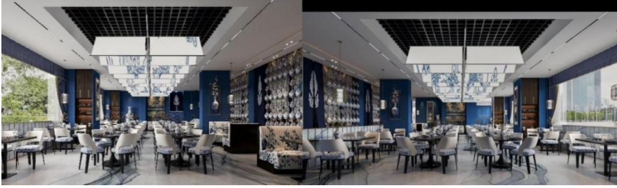
Fig. 10. the dining area is partitioned by lamp shapes and blue and white porcelain bottles. (Image source: drawn by the author)