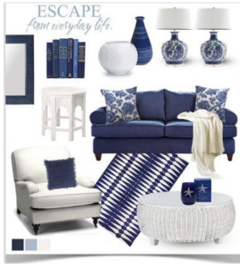
Fig. 5. soft furnishing sample.