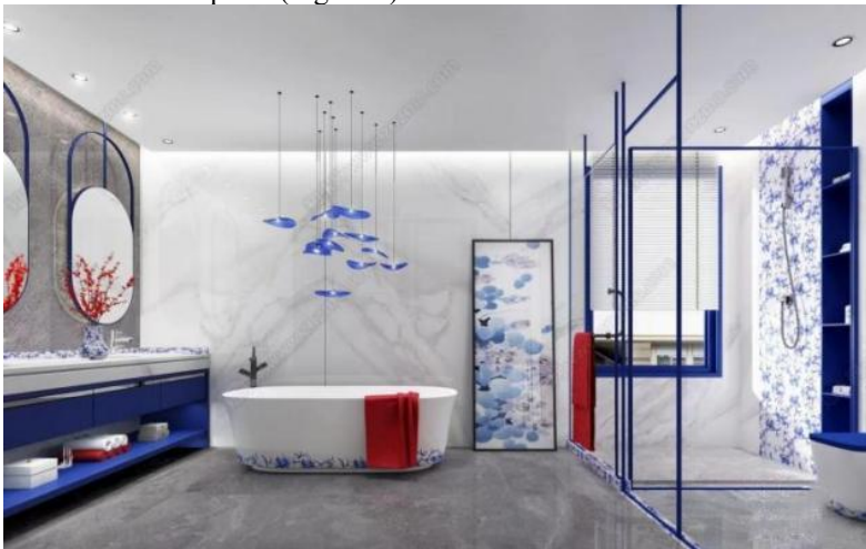
Fig. 3. blue and white with patterns

Blue and white art can be applied to walls, floors, and ceilings, adding a cultural atmosphere and a novel sensory experience to the space. In furniture and tableware design, blue and white porcelain can highlight the characteristics of Chinese traditional culture and enhance design and artistic value. At the same time, applying blue and white art to lighting fixtures and artworks can inject artistic and Chinese traditional cultural characteristics into the space. (Figure 3).