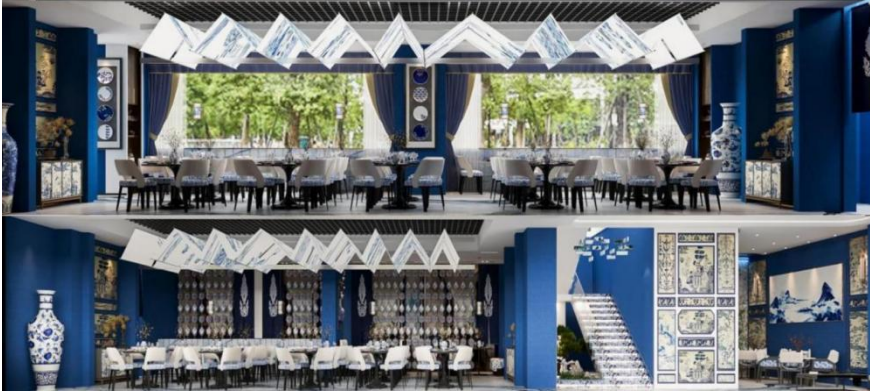
Fig. 8. Common Dining Area. (Image source: drawn by the author)

This restaurant, focusing on blue and white porcelain aesthetics, cleverly combines tradition and modernity, classics and innovation through unique applications in spatial interface design. Whether it's delicate wall patterns, clever partition devices, or staircase with mosaic of fragments, they all demonstrate a profound understanding of blue and white porcelain culture and creative design [9] . Here, people can not only savor delicious food but also experience the charm of tradition and the innovation of the modern world. (Figure 8)