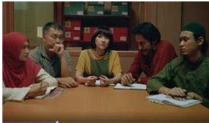
Fig. 3. Diana at the meeting

From there, it can be seen that only Diana is brave enough to take action, show intelligence, initiative, and think about how to take revenge against the bossman's arbitrary treatment. Diana frequently gets angry and frustrated to the point where she contemplates quitting her job because of Bossman.