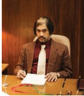
Fig. 4. Bossman

Bossman is the main antagonist character that can be seen throughout the entire story where the character opposes the main character, also known as the antagonist. The antagonist is someone who opposes or challenges the protagonist, either directly or indirectly, both physically and mentally. In a story, the antagonist is a character who obstructs the goals of the protagonist. Bossman has the most conflicts with Diana. Example can be seen in this scene at 1:16:41;