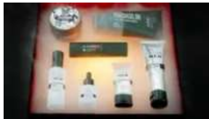
Fig. 4. Scene 7 (Close Up)

This explains that today's tire patchers can also be clean and look fresh and more confident with a more modern appearance. This is also an interpretation of #AllWeCan.