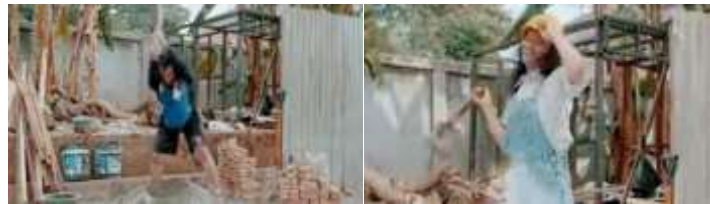
Fig. 1. Scene 1 (Full Shot and Medium Shot)

The results of the semiotic analysis of the Ms Glow For Men advertisement by Babe Cabita and Marsel Widiyanto analyzed the meaning of the hashtag #SemuaJugaBisa which consists of 8 scenes with 14 images. The advertisement contains images, settings, and dialog that are described in detail with Charles Sanders Pierce's semiotics which consists of signs (signs), objects (objects), and interpretants (interpretants).