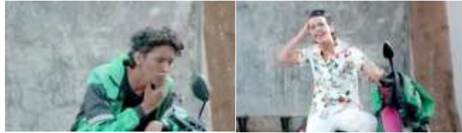
Fig. 2. Scene 2 (Medium Shot)

nowadays coolies can also have bright and clean skin by wearing a more neat and modern look while working.