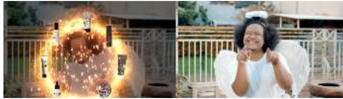
Fig. 5. Scene 8 (Medium Shot)

Sign: In scene 8, the marker system in scene 00:01:25 - 00:01:36 shows that there are 7 products from Ms. Glow which are shown to have the power of a circle of orange sparks by the fairy. The fairy is dressed in a predominantly white color with a happy and cheerful facial expression while dancing. The products are believed to be able to make dull men handsome. Here is the dialog from the scene: "This time I can definitely make you handsome!".