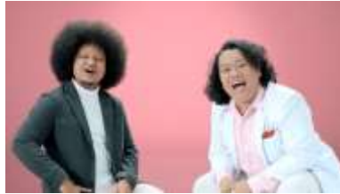
Fig. 7. Scene 10 (Medium Shot)

appearance. Set in a dark black bathroom, this certainly gives the impression that this setting is like a simple bathroom in Indonesia in general. as well as bathing equipment such as a dipper and a blue barrel that the average Indonesian uses for bathing. It is different from other product advertisements that use a setting with a more aesthetic and modern bathroom. With the cut scene above, the two men are depicted as unmasculine, dark-skinned, and look a little feminist because they are wearing these suits. However, this shows that both men can be more confident, look clean, bright and happy by using products from MS Glow For Men.