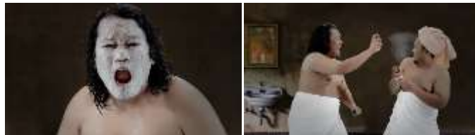
Fig. 6. Scene 9 (Close Up and Medium Shot)

Interpretant: In scene 8, we see the return of the fairy from the palace carrying 7 products from MS glow for men. As seen with a medium shot the fairy takes out all the products in a circle of orange sparks which means that each product has magical powers that can change the appearance of men. It can also be seen that the fairy is wearing an all-white outfit that signifies harmony and purity. Then with a dark background that signifies the release of the power of the product. This has the interpretation that the products from MS Glow have additional power that can realize the wishes of all local Indonesian men to be brightly glowing.