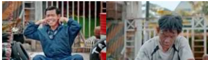
Fig. 3. Scene 3 (Medium Shot)

Interpretant: In scene 2 shows a man in a green jacket, which means that he generally works as a motorcycle taxi driver who initially looks ordinary, dull and looks insecure. It can be seen from his sullen facial expression while holding his chin towards the rearview mirror of the motorbike, the background selection of gray walls which has a flat and sad meaning, and can also be neutral. after that he was changed by the fairy played by Babe Cabita to glowing clean and more confident. The man is replaced by white clothes with floral motifs that mean clean, beauty, feminism and happiness.[15]. This symbolizes that self-care can be done by field workers who in fact work against heat rays and dirt dust that can make dull.