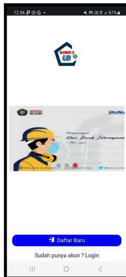
Figure 1 SIMK3 UB Application Login Display