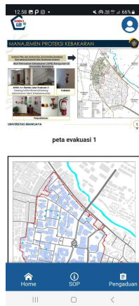
Figure 4 Evacuation Map Display of SIMK3 UB Application