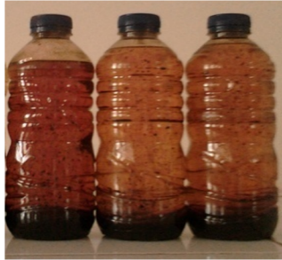
Fig. 1. Grade 3 Liquid Smoke after standing for 1 week

with the study by [13], stating that grade 3 liquid smoke typically presents a concentrated brownish-yellow color with a strong aroma. The liquid smoke is then allowed to settle for one week. The settled liquid smoke can be seen in Figure 1 below.