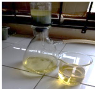
Fig. 2. Liquid Smoke Grade 2

The clear yellow-colored distillate is continued for filtration with zeolite and activated carbon (1:10). The resulting filtrate is light yellow in color, and this last stage is called grade 2 liquid smoke can be seen in Figure 2.