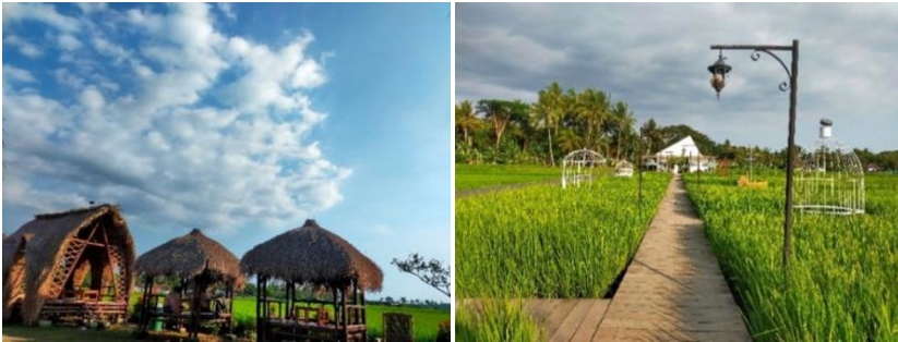
Fig. 2. Culinary Portrait of Kulon Progo Venue: Mahaloka Paradise at Nanggulan Kulon Progo Source: Author's collection (2024)

Previously, the impact of tourism on the environment encouraged research on sustainable tourism development [13], with the triple bottom line approach influencing the understanding of the concept of sustainable tourism [14]. Fig. 2 as an appreciation of the revival of Kulon Progo tourism, which is dominated by the agricultural sector. A study was conducted by bringing entrepreneurship and SDGs closer together. The entrepreneurship approach encourages the implementation of the CBT to realize sustainability social welfare. As a representation of the market, tourists or the visitors should be aware of the limitations and advantages of community-based tourism.