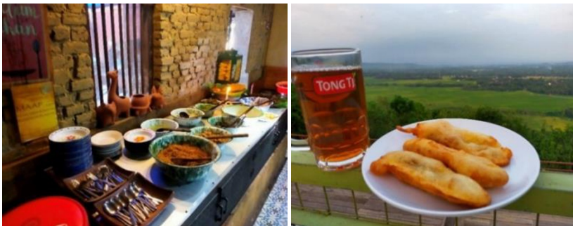
Fig. 4. Local Cuisine and Snacks in Kulon Progo Tourism

Environmental aspects related to SDG-12 to form mutually responsible consumers and producers. In line with [31], the formation of perceptions of social welfare encourages the consumption of green products, while creating the healthy tourism [32]. It is necessary to involve business actors to innovate through green products and circular products for making souvenir. It proves that sustainable tourism requires responsibility for environmental sustainability. SDGs-14 and SDGs-15 related to green behavior such as orderly handling of waste, awareness of waste sorting, recycling, maintaining river cleanliness and conservation behavior are important to practice in the management of tourist villages. SDGs-13 is related to climate change so that the conservation behavior of highlands and coastal areas through mangrove conservation or protecting the southern coastal ecosystem, such as conserving turtle habitat.