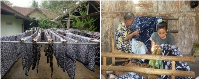
Fig. 5. Batik in Kulon Progo's Tourism Venue: Batik Farras (Light) and Batik Sembung (Right)

spices and vegetables. Various chili sauces are never separated from rural cuisine. For snacks, fried bananas, fried tempeh, fried cassava, or Geblek specialties are usually provided with drinks such as fresh tea, sweet tea or Wedang Uwuh served hot. Wedang Uwuh is a drink with ingredients such as ginger and dried leaves similar to spices such as clove leaves, lemongrass, secang wood shavings with traditional sugar as a sweetener. There is Menoreh coffee as a local commodity. Enjoyed on the edge of rice fields with a panoramic view of green or yellowing rice.