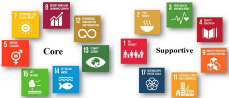
Fig. 1. Role SDGs in Developing Rural Tourism

the development process. This is in line with the guidelines in UNWTO [4]. The relevance of SDGs in the tourism sector is mapped into two clusters as illustrated in Fig. 1 . The main targets are reflected in SDGs-5 (gender equality), SDGs-7 (renewable energy), SDGs-8 (decent work), SDGs-12 (producer & consumer responsibility), SDGs-13 (climate change), SDGs-14 (life below water), and SDGs-15 (life on land). These goals are the foundation of innovation on tourism village. Such as the study of [5] which explores the SDGs approach in developing tourist villages.