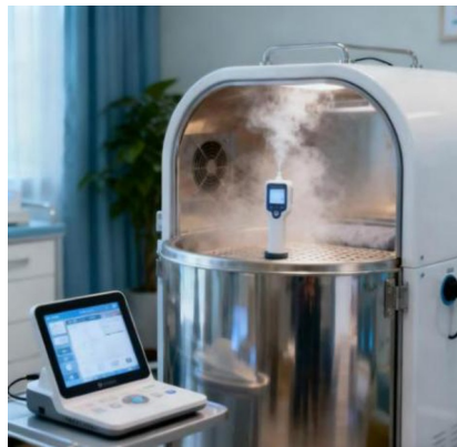
Fig. 2. Computer detection system