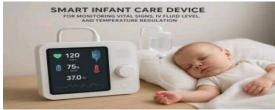
Fig. 1. smart infant care device

was utilized in conjunction with the other sensors to provide accurate readings of the IV fluid levels to avoid over- and under-infusion [3]. All sensor data was processed using algorithms developed in Python. If any of the abnormal conditioning variables were identified (i.e. increased temperature, irregular heart rate, reduced IV fluid) an alert was sent to the nurse's mobile device using the mobile application called Blynk and movements and positional data of infants are sent through an automated messaging bot Fig.1.