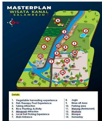
FIGURE 3. The Map of Tourism Potential in Salamrejo Canal

In general, the Salamrejo Canal falls into the category of natural tourism, where, according to [15] natural tourism objects are natural resources with potential and appeal to visitors, both in their natural state and after cultivation efforts. The map of tourism potential can be seen in Figure 3.