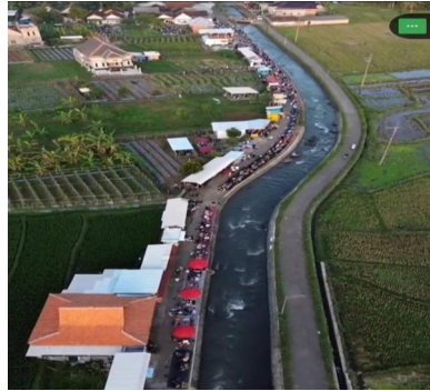
FIGURE 1. Current conditions of the canal

River or canal rejuvenation involves four key elements of waterway tourism: the waterway's structural features, land-based experiences, water-based experiences, and boat-based experiences [28]. Management of river or canal areas is often integrated with efforts to harness their potential as natural resources that can enhance community welfare. The Salamrejo village government and community have initiated riverbank improvements to maintain river flow and develop public spaces for community use. Optimizing the potential of the Salamrejo Canal is essential to maximize benefits for the local population.