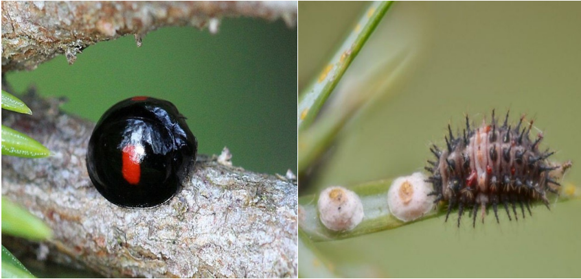
Figure 4. Hylocorus - Imago and larva of the entomophage Hylocorus

Chilocorus - Chilocorus, Exterminates aphids, mites and pseudocots. If there is a colony of scabies on the tree, he prefers this particular colony of scabies. During the season, the hylorus gives two generations. Beetles overwinter in gardens, among fallen leaves, among bark and in other protected places. In addition, the larvae and imagos of the seven-point golden-eye ( Chrysopa septempunctata Wegrn), common golden-eye ( Chrysopa carnea Steph) and ladybirds are of great benefit by feeding on eggs and larvae of sucking pests.