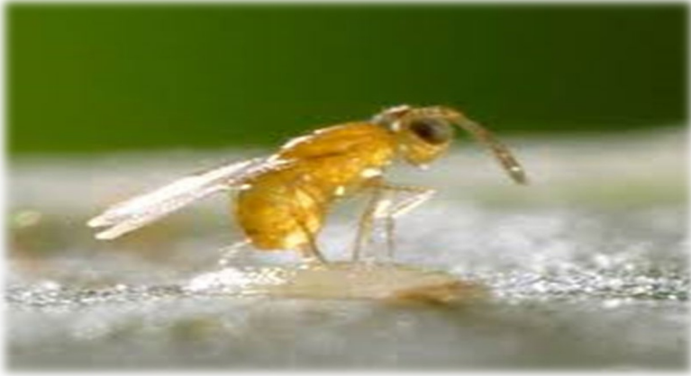
Figure 3. Aphis praecia imago

Currently, the female California scale insect pheromone has been isolated in the USA and its structure, composition, and biological activity have been studied. Feromon and its components, synthesized in the USA, were brought to the Russian Federation for scientific research. The results of scientific research have shown that the given feromon substance has high biological effectiveness and can be used to detect pest foci. In 1981, this feromon was synthesized by scientists from the Institute of Organic Chemistry and the N.D. Zelinskiy International Institute for Biological Plant Protection of the Russian Academy of Sciences. The arms of the male California scale insect are made of 9x25 cm paper covered with film and are bent. A special glue is applied to the inner side of such a handle. The holder is attached to the columns, and a capsule with a feromon is placed in the center of the glue. The handles are placed between the branches of the middle tier of the tree, with each hectare.