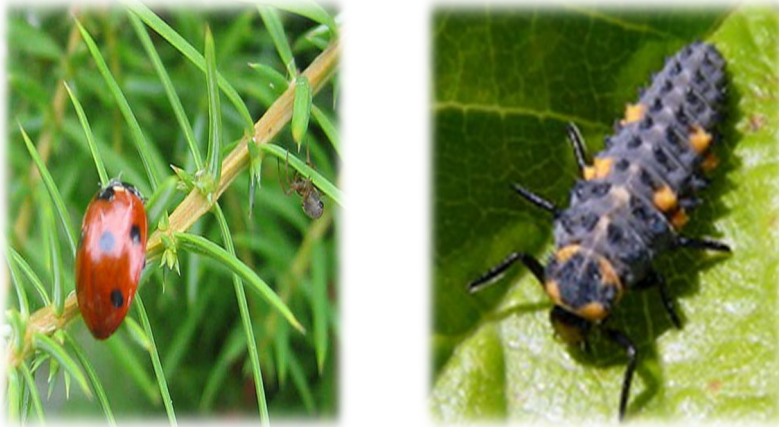
Figure 1. Coccenella sempenpunctata L.

The seven-pointed ladybug is known for its bright red wings and black dots on the wings. It mainly destroys aphids, mites, and insect eggs. During the years of mass reproduction of beetles, the Khan's daughter, after harvesting grain crops, in June-July, a large number of beetles penetrate the orchards, destroying first aphids and mites, and then scale insects. During this period, 500 or more hanqizis can be observed on a single tree. Khan's daughter's beetles destroy shield beetles in all phases, leaving only the shield beetle's abdominal layer after feeding. Khan's daughter's beetles develop within 10-12 days, after which they enter diapause. The larva of the seven-spotted ladybug does not feed on the scale.