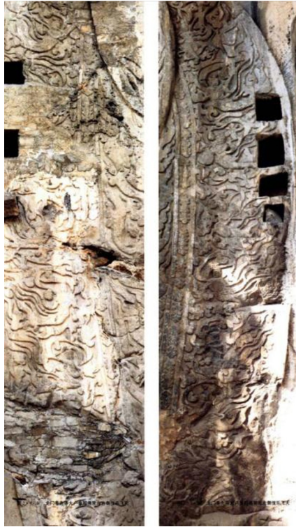
Fig. 5. Unknown, Longmen Grottoes, Fengxian Tempel, Vairocana backlight musicianapsara . early Tang Dynasty, in Series of Musical Relics in the Central Plains: Henan, Zhengzhou : Elephant Press, 1996, p. 250, cat. no. 2·6·8c. and 2·6·8d.