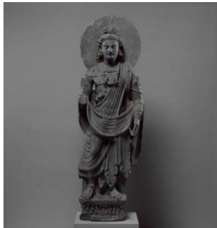
Fig. 1. Unknown, Standing Bodhisattva Maitreya (Buddha of the Future) . ca. 3rd century, Gray schist, 64 1/4 × 21 × 8 in., The Metropolitan Museum of Art, New York, www.metmuseum.org/art/collection/search/38474

India's earliest statues were from Gandhara. Gandhara's Buddhist statues have a strong sense of Greek sculpture because of the influence of Greek culture (see Fig. 1), and the image of apsara statues inherited the Greek mythological modeling of angels. [4] As Buddhist art in India continued to evolve in practice, a style of Buddhist art that fully conformed to Indian aesthetic ideals and localized culture emerged, known as the Mathura art, that took shape during the Gupta dynasty (320-540 CE). It is characterized by figurative figures, semi-nude, robust, and voluptuous, with light and close-fitting clothing. Didarganj Yakshi highlights this stylization, which laid down the basic image pattern of the later Indian apsaras. [4]27 These apsaras are moderately proportioned, emphasizing the beauty of the body curves, but have a low sense of flight (see Fig. 2). Their styling clearly incorporates localized cultures, as far as the semi-naked image, and probably comes from the sutra. [4]12 In India, there are a large number of apsaras images adapted from this model in the sculptures of caves and temples, which can be seen in the Great Stupa of Sanchi, the Bharhut Stupa, the Ajanta Caves, and the Great Shrine of Amaravati.