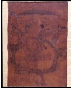
Fig. 6. Unknown. A Man Riding a Dragon . Warring States period, silk painting, the Zidanku Tomb No.1 in Changsha, www.hnmuseum.com

Initially, the rise of Taoist culture caused a craze for immortal ascension in the Eastern Han Dynasty (25-220 CE). Many theories and images of feathered individuals ascending to immortality appeared, such as the illusion fantasy of a feathered immortal depicted in the pictorial stone (see Fig. 7). Later, Taoism, a Chinese indigenous religion, blended with Buddhist culture in order to satisfy its development needs because of Buddhism's widespread flourishing in the mainland. Thus, the belief of immortality evolved from "becoming immortal in the body" to "the soul ascends to heaven and becomes immortal in the next life," claiming that one's soul does not need to be "feathered." In other words, the act of "feathering" and the presence of feathers or wings are unnecessary to immortalize the soul. Then, a new perspective on immortals is stated in the Taoist canon: "Immortals flying easily without feathers or wings" because "Immortals with feather wings have lost their human essence". [19] This viewpoint was accepted by the people of the time because the localized images of the flying apsaras in the Central Plains style lost their feathers or wings in the late Northern dynasties. It also explains why the halo behind the head of flying apsaras vanished during the same period. The shifting representation of flying apsaras projects the profound influence of the traditional Taoist culture in China.