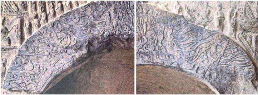
Fig. 4. Unknown, Lintel of Su Huren niche in Longmen Grottoes . 525 CE, in Series of Musical Relics in the Central Plains: Henan , Zhengzhou: Elephant Press, 1996, p. 245, cat. no. 2·6·6a. and 2·6·6b.

Another critical period was in the Tang Dynasty when flying apsaras completely achieved the transition to their localized image and fully expressed the features of Chinese culture. At this time, they appeared the same as the locals, flying over the cloudy pattern without wings or feathers while holding a variety of instruments in different gestures. For instance, the eleven extant female flying apsaras at the halo of Buddha Locana in Fengxian Temple have full-figured bodies and rounded faces that convey vivid secular traits (see Fig. 5). At this point, the image of Chinese localized flying apsaras with indigenous culture and national style was finally formed. It raises the question of what factors shape their image in the localization process.