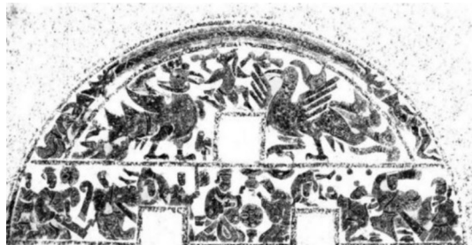
Fig. 7. Unknown. Pictorial Stone of Phoenix, Feathered Immortals, and Entertainment in Eastern Han Dynasty . Eastern Han Dynasty, stone, the East Yishui County Cultural Relics Management Station, Shandong Province, peopleart.tv/201889_2.shtml

Initially, the rise of Taoist culture caused a craze for immortal ascension in the Eastern Han Dynasty (25-220 CE). Many theories and images of feathered individuals ascending to immortality appeared, such as the illusion fantasy of a feathered immortal depicted in the pictorial stone (see Fig. 7). Later, Taoism, a Chinese indigenous religion, blended with Buddhist culture in order to satisfy its development needs because of Buddhism's widespread flourishing in the mainland. Thus, the belief of immortality evolved from "becoming immortal in the body" to "the soul ascends to heaven and becomes immortal in the next life," claiming that one's soul does not need to be "feathered." In other words, the act of "feathering" and the presence of feathers or wings are unnecessary to immortalize the soul. Then, a new perspective on immortals is stated in the Taoist canon: "Immortals flying easily without feathers or wings" because "Immortals with feather wings have lost their human essence". [19] This viewpoint was accepted by the people of the time because the localized images of the flying apsaras in the Central Plains style lost their feathers or wings in the late Northern dynasties. It also explains why the halo behind the head of flying apsaras vanished during the same period. The shifting representation of flying apsaras projects the profound influence of the traditional Taoist culture in China.