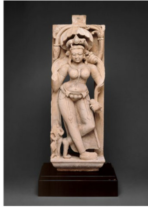
Fig. 2. Unknown, Celestial Beauty (Apsara) . 701-800 CE, Buff sandstone, 33 1/4 × 11 1/4 × 6 in., Art Institute of Chicago, Chicago, www.artic.edu/artworks/148372/celestial-beauty-apsara

In 65 CE, Buddhist art with Buddhism was imported from India to China through Chinese Turkestan (Xinjiang region). [5] Thus, the apsaras came to China and gradually became “flying apsaras”. Flying apsaras have a long history in China. The ancient record of flying apsaras refers to “Tianren”, which can be traced back to the Lalitavistara Sutra, [6] which Dharmaraksha translated during the Western Jin Dynasty (265-317 CE). The earliest Chinese word, Feitian , appeared in the Eastern Wei Dynasty in A Record of Buddhist Monasteries in Luo-Yang in 547 CE. [7] It refers to Buddhist celestial beings who sing, dance, or hold flower trays or incense burners dedicated to the Buddha. At this time, the image of the flying apsaras had already appeared in China and gradually spread to different regions in China with the development of Buddhist art. A large number of flying apsara images exists widely in China throughout the grottoes and temples at present, such as the Kizil Grottoes in Xinjiang region, the Mogao Grottoes in Gansu province, the Yungang Grottoes in Shanxi province, the Longmen Grottoes in Henan province, the Longxing Temple in Shandong province, and the Dazu Grottoes in Sichuan province.