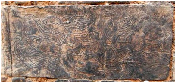
Fig. 9. Unknown. Pictorial Stone of Immortals Riding Dragons on the West Wall of M109 Tomb. Eastern Han Dynasty, stone, Yuhang district, kaogu.cssn.cn/zwb/xsyj/yjxl/qt/201610/t20161021_3939228.shtml