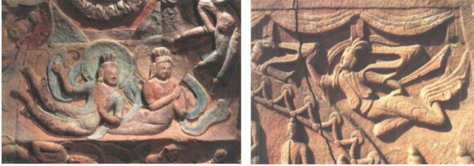
Fig. 10. Comparison of Flying Apsaras in Cave 7 and Cave 31, Yungang Grottoes. 471-494 CE, Yungang Grottoes Cultural Relics Depository. China's Grottoes: The Yungang Grottoes Volume 1 , Beijing: Cultural Relics Press, 1991, pp. 166-172, 206.

The Southern dynasties were a continuation of the Han nationality regime. It was situated in the Jiangnan region, far from the war compared to the north, and became the cultural center of the time. The thin and slender figure was the typical aesthetic of the Southern dynasties. On the one hand, the “Nine-rank system” of official selection in the Southern dynasties encouraged people to pursue virtuous evaluation. [23] The Nine-rank system intended to weaken the influence of the nobles by selecting officials who were evaluated as possessing good personal qualities from less powerful families and commoners. It was well-intentioned but had the undesirable effect of creating a system in which people linked excellent morality with a slender appearance during that time. For example, in the prevalent literature, the deviation occurred when evaluating the character's quality in A New Account of the Tales of the World , compiled by Liu Yiqing of the Southern dynasties. A specific chapter [24] focused on the appearance and manner of various figures, arguing that it is related to their attributes and even affected their behavior and deeds.