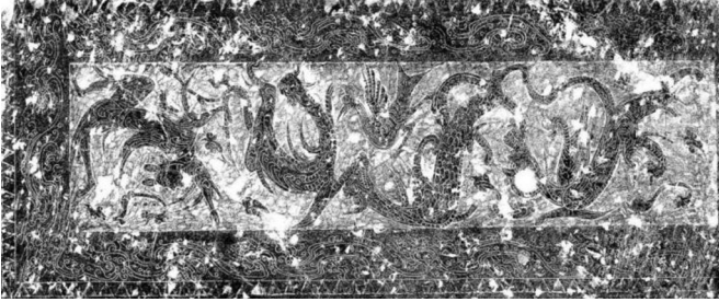
Fig. 8. Unknown. Pictorial Stone on the West Wall of the Front Room in Yinan Han Tomb. Eastern Han Dynasty, stone, Beizhai village, Yinan Beizhai Han Pictorial Stone Tomb Museum, Shandong Province, www.thepaper.cn/newsDetail_forward_7408149

To summarize, the inherent factor of Chinese traditional culture explains the majority of flying apsaras holding their instruments and the distinctive features of flying apsara images, such as the absence of a halo, wing, or feather, and cloud pattern to fly. As for other concrete changes in the essential sinicized process, it is necessary to consider the external social environment elements.