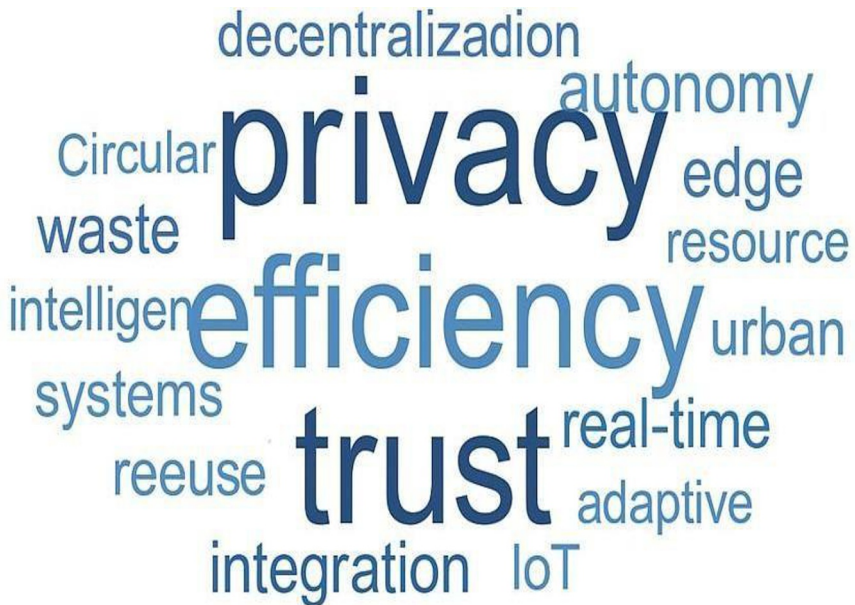
Fig. 1. Expert Sentiment on FCIoT Effectiveness (NVivo Word Cloud)

surveillance risk. As an innovation of critical importance to keep user trust to digital ecosystems, it pointed out federated learning. Real-time Traffic Optimization, the second highest theme, emphasizes the need for decentralized, adaptive mobility systems that can adapt to congestion dynamically. All in all, the experts also saw the transformative potential of IoT empowered resource efficiency and the integration of the Circular Economy to spurulate shift towards sustainability focused, intelligent infrastructure.