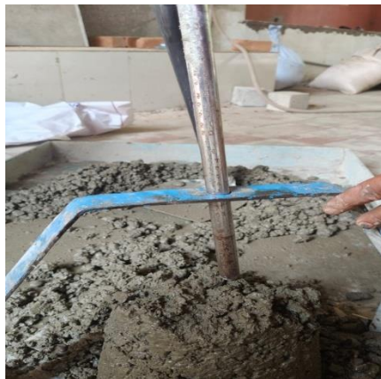
Fig2: M30 Concrete Mix Design Execution

10. Cube Strength = > 20 \text{ N} / \text{mm}^2 Refer Fig. 3.