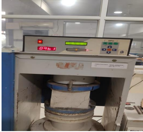
Fig3: M30 Concrete Mix Design Execution