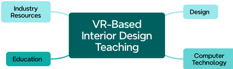
Fig. 3. Diagram of the Interdisciplinary Collaboration Mechanism for VR Interior Design Education

lectures or short-term training sessions and toward sustained collaborative teaching, technical mentoring, and project-based support. This is because teachers' level of preparedness directly determines whether VR can be effectively integrated into curriculum design, rather than being used only as a tool for visual display.