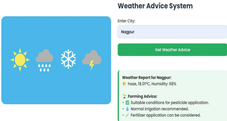
Fig.4. Weather Advisory

The system fetches weather data based on the user's location and converts it into simple, actionable agricultural recommendations.