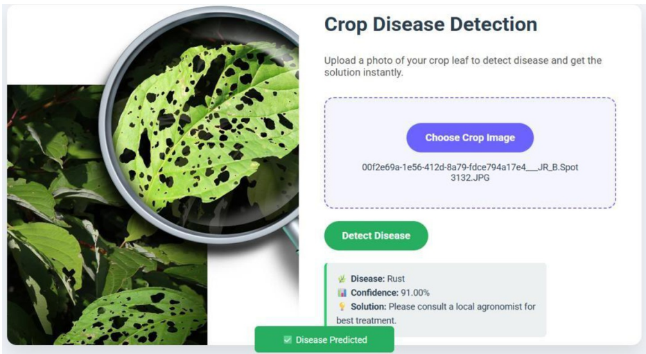
Fig.2. Crop Disease Detection

The plant disease detection model was tested using leaf images from the PlantVillage dataset. The CNN model correctly identifies diseases and labels them with confidence scores.