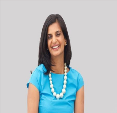
Fig. 1. (PREETHI NAIR-- https://www.amazon.in/stores/author/B0045A50VK ) Introduction

The narrative structure has the use of the flashback technique also. Against the backdrop of diaspora elements the novel has been discussed as an inspiration to the other NRIs to have faith in whatever they have learnt and practiced.