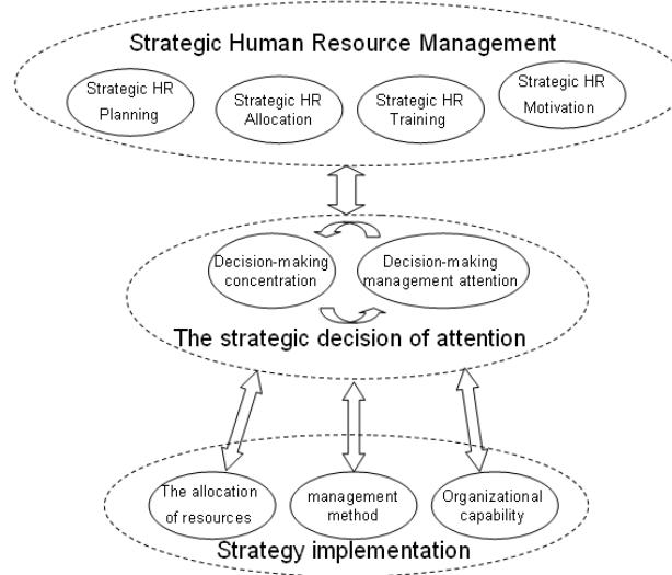
Fig. 2 The influence model between the strategic human resource management, the strategic implementation and the strategic decision of attention

Taking these elaborate, figure 2 shows the influence model between the strategic human resource management, the strategic implementation and the strategic decision of attention.