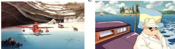
Figure 4. Movie scene of Red Pig.

"Red pig" is often forgotten in the works of hayao miyazaki film, but he really spent a lot of effort, not just his painting life work, more is his analysis of the self. In the country, age, life significance of these serious proposition, he created a "cool pig" image of the contradictions in any doubt. Do not lose the essence of cartoon culture and contain is worn for war, and time thinking and criticism.