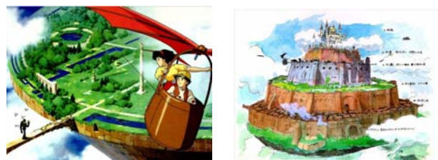
Figure 5. Movie of sky city.

Once the brilliant sky city with a very advanced science and technology, but the civilization disappeared overnight, his people no longer go back on the ground, seclusion its wealth unclaimed left in the sky, leaving no one believes a legend, but some believe, for its untold riches, developed science and technology, and invincible weapon, even if it means dying. So colorful characters and infighting very lively, but in the end the sky city still belong to his master - hilda, greedy JiaYiChang all for her.