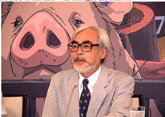
Figure 1. Hayao Miyazaki.

Artistic creation is inseparable from the creator of the era of life and cultural traditions. As Dana said: "the artist itself, along with all of his works, also is not isolated. There is a general, including artists, the wider than artists, is what he is, but at the same time with the art of sectarian or art family." Also include "art of the family itself within a larger overall, is around it and consistent interest and his society." One can't avoid to live in a particular cultural tradition. Affected by specific cultural tradition and The Times. The creation of the animation master hayao miyazaki is also influenced by their own time and culture. If based on the relationship between man and nature thinking form the hayao miyazaki's ecological view of anthropocentrism. So influenced by Japan's political, economic, cultural, witnessed the war to the state and the destruction of human civilization, has contributed to his anti-war thought the reason.