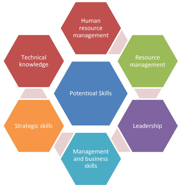
Fig. 2. Potential skills which could be acquired by using SGs

study and can result in several implications for practitioners and research.