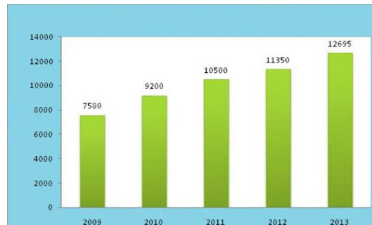
Figure 2 2009-2013 China B2B e-commerce market enterprise size (units: one)

Source: China Electronic Commerce Research Center