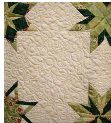
Fig 3 top stitch