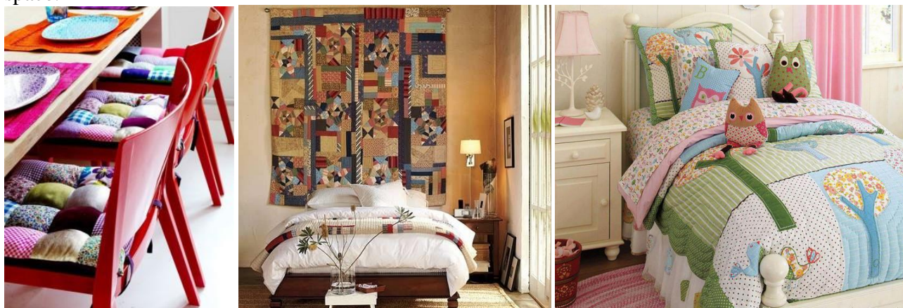
Fig 7 One corner of the dinning room

floral print and grid print, corresponding to patterns of the dinner plates to achieve a harmonious and unified visual effect. As with space of bedrooms, quilting art products are needed for improving a feeling of warmth and degree of visual fitness in the interior space. The fig. 8 presents space design of a bedroom with a simple style. In the bedroom, the big quilting artistic wall tapestry is functioning as background wall of the bed while playing a role of dividing the space. Besides that, most colors of the tapestry are similar to colors of the ochre walls, redwood furniture and black photo frame. Visually, the tapestry has been integrated into the environment perfectly, contrasting to the white bed clothes. As with the colors of the bed clothes, pure white color is not applied thoroughly; instead, quilting design corresponding to the tapestry is applied for creating a simple and cozy visual effect for the space.