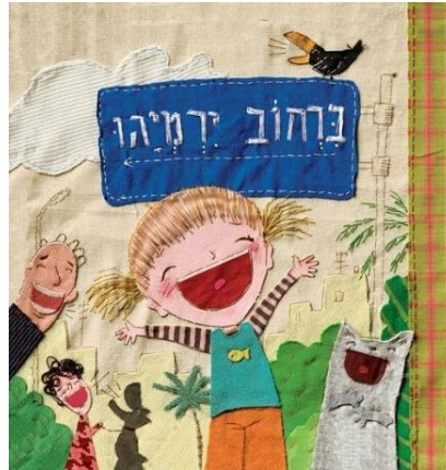
Fig 2 appliqué stitch