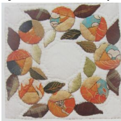
Fig 5 Garland