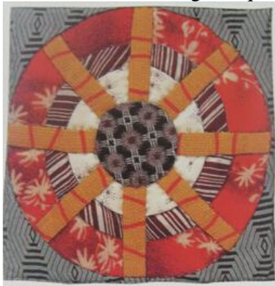
Fig 4 circles ▪ curves

Traditional quilting is particular about the harmonious beauty between colors and their implications. Therefore, in aesthetic design of postmodernism, harmonious colors have evolved into aesthetic fatigue in the new era and anti-traditional colors for highlighting individualities have been used in the artistic design of quilting, such as Elle decorative quilting furniture (Fig 6).