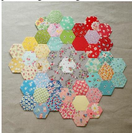
Fig 1 splicing of small pieces