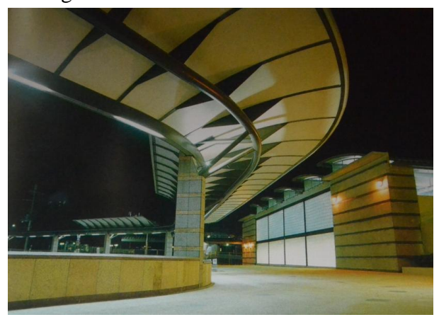
Figure 1 JR Nishinomiya Nashino Station Square

As shown in figure one, the bus station platform awning of the JR Nishinomiya Nashino Station Square, which was designed by GK Sekkei Incorporated, Osaka Office, was designed as a bird soar to great heights in order to coordinate with the surrounding mountains, meanwhile the near square parking lot was built as well. As a spatial symbol, the platform awning modeling design has fused its geography features of surrounding mountains to make the platform more generous and beautiful, which has perfectly shown its regional environment character.