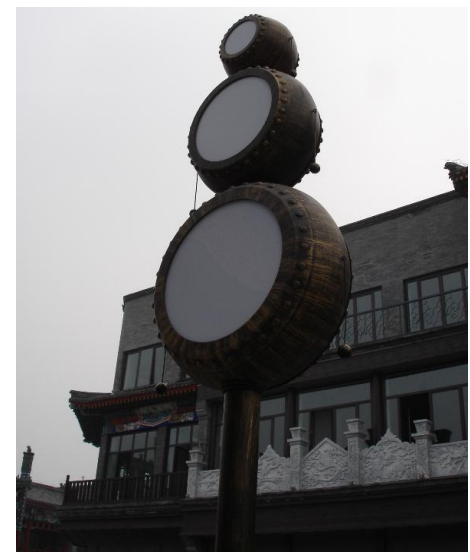
Figure 12 the Rattle-drum Lighting Facilities of Qianmen street in Beijing