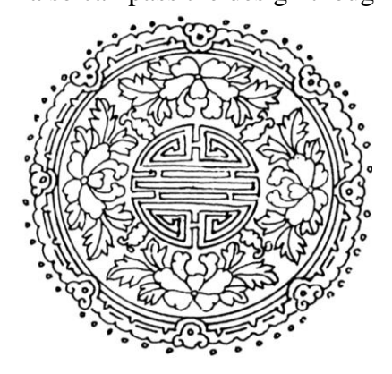
Figure 8 Traditional Auspicious Pattern

As shown in figure 8 & 9, the design of city streets lamp in Suzhou absorbed the "Hui" pattern in national culture, which has show its strong art penetration force without losing its function. In figure 10, the ground spelling is also evolved from the traditional pattern. The design pattern is very elegant; it not only bears its surroundings but also added the attraction of the static facilities. Besides, the character of "Hui" means big fortune and good profits in Jiangzhe's traditional culture, which was called as "constantly prosperous and rich" in Suzhou. Therefore, by melting into the design of regional urban environment facility, such kind of design will vividly shows its regional character from the form of shape and its content connotation. The pattern we stated before is always interdependent in the urban element design. Retrieval the original character of the traditional architecture and environment facility design which is connected with the urban pattern element, we can see the elements no matter the form and content, connotation and thought are all well melted into the design. Such kind of coexistence multiple designs can not only increase the visual appealing but also can pass the design thoughts, improve the city's cultural accumulation.