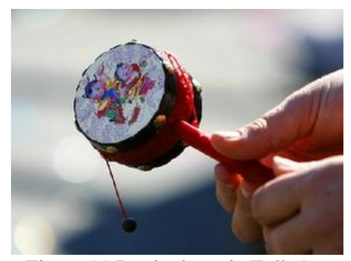
Figure 11 Rattle-drum in Folk Arts and Crafts

which was mainly reflected in clothing, etiquette, production, livelihood and the daily life behavior ect. The various kinds of material characteristics have added different kinds of art style to the urban element design. For example, the lamp in front of the Beijing streets, gives people an extraordinary experience after the innovative design. (As shown in figure 11 & 12). The Rattle-drum is one of the oldest and traditional toys in Chinese history, which was originated from Song dynasty and was regarded as the selling tool by merchants. It looks like a tank, very unique on both sides, like a strap, handling the drum roll handle, the strap will flap on its surface and send out voice. Right now, by melting this kind of modeling into the lamp design, we have achieve the complementary environment effect with the territory style and features in the front gate pedestrian streets, meanwhile can remind the citizen's plenty of wonderful memorizes. The lighting design is very unique, besides its original functional use, there is art element and finally reach the harmony between human and the city culture.