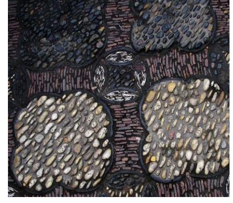
Figure 10 the Floor Decoration of Historical and Cultural Blocks in Suzhou