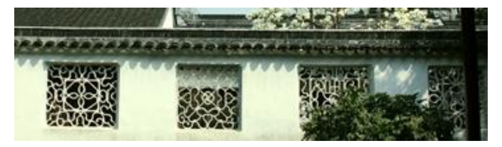
Figure 7 Doors and Windows Decoration Pattern in Suzhou Garden