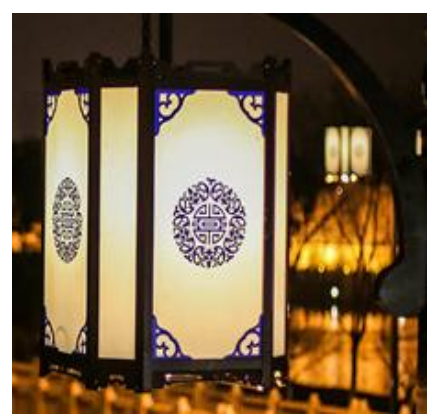
Figure 9 Lamp in Suzhou Streets