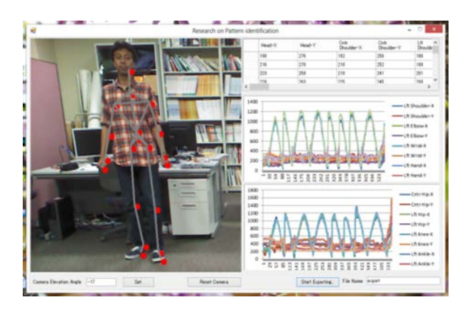
Fig.1: Application Interface for analyzing the gaits to identify the major joints that are used to determine the features.

The initial step involves the technique of identifying a person while in motion and generates the skeleton frame from the captured data. For this task, a device from the Microsoft called Kinect for Windows is used. This device has the ability to detect human motion and generate skeleton with 20 different joints. To interface this device, we developed an application that could track a person. A sample snapshot of this application is shown in Figure 1.