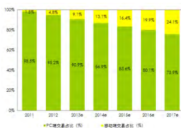
Figure7. Proportion drawing of PC and mobile trading volume of China in 2011-2017

The application size of mobile internet is constantly expanding, in view of the online sales mode of Xiaomi phone, it's absolutely possible to market on the mobile terminal, in addition, the transaction size is constantly expanding. The overall transaction scale of online shopping is RMB1,850 billion in 2013, and transaction scale of mobile shopping is RMB167.64 billion