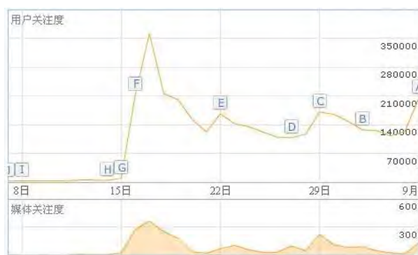
Figure6. Xiaomi handset awareness in the Mi fans festival

The impression of Xiaomi for most people who know little about it is limited to this, but the development of Xiaomi was unexpected. The owners of Xiaomi phone declare themselves as “Mi fans”, which is the major force of Xiaomi getting involved in the fashion culture and being popular suddenly. The regularly held “Mi fans festival”, rip-roarious BBS, the decorations, accessories, t-shirts, photography, music and micro film derived from Xiaomi compose the content of Xiaomi culture together. The fans culture of Xiaomi phone actually possesses the sample characteristics of public consumer culture nowadays, and shows its significance of meaningful production, pleasure economy and identity politics.