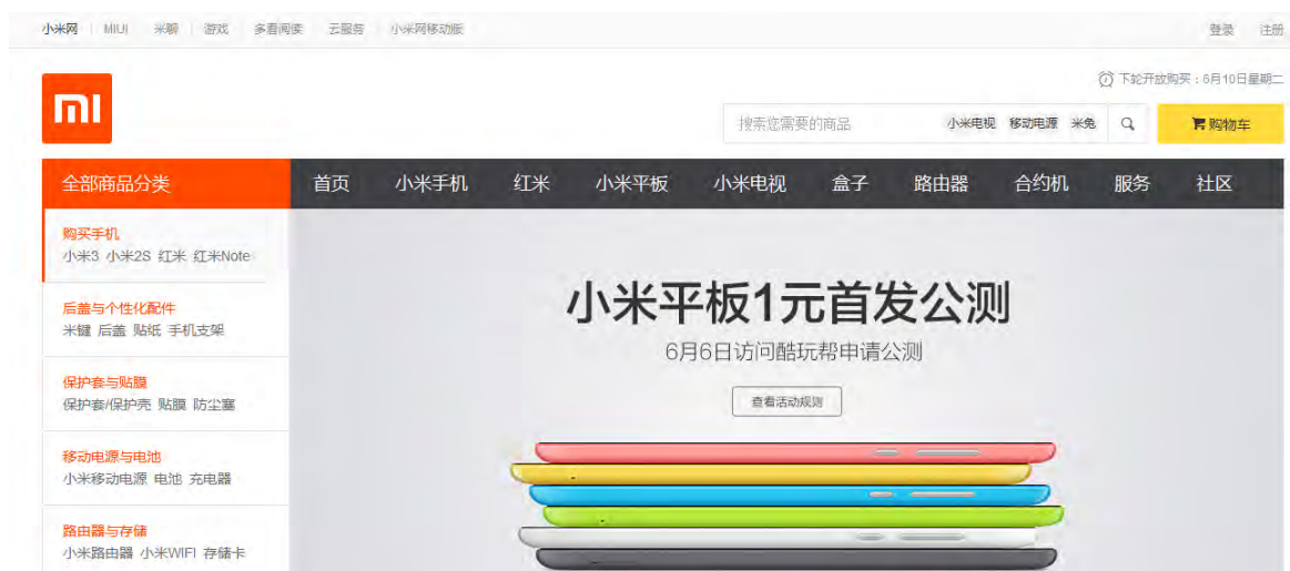
Figure4. Official website home page of Xiaomi phone

coolplay, 10 points, business hall, service support, MIUI, Mi chat, community, etc. The official website of Xiaomi can basically meet the operating requirements