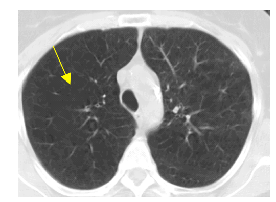
Figure 1: A typical HRCT scan containing emphysema. The regions pointed by arrows denote emphysema.

accurate technique to detect and quantify emphysema that is useful to radiologists.