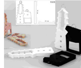
Fig4 Tourism product design with WenZhouYanDang mountain theme Fig5 Tourism souvenir product design with WenZhouJiangXin island theme

2.2 Two towels in JiangXin island, JiangXin island is a oasis set in the OuJiang center, and two towels is the soul of the island, in order to express towel’s image with it’s appeal, the same cutting, hollow out with special visual effect, contracted but not simple....., simple processing, common material, it will be a good and cheap souvenir travel to JiangXin island as Fig5 shows.