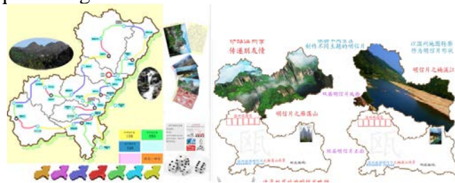
Fig2 The tourism chess on WenZhou theme Fig3 Tourism postcards with WenZhou theme

Through this set of wenzhou tourism chess we can see the scenery, taste the humanities, play the souvenir's design concept. As Fig2 shows.