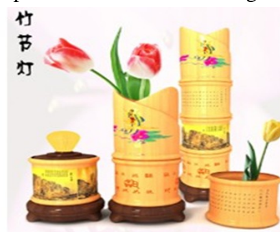
Fig8 Tourism products with pens theme Fig9 Bamboo tourism souvenir designer1 Bamboo tourism souvenir designer2