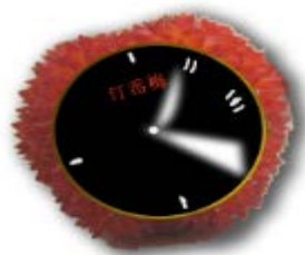
Fig10 Tourism product design with WenZhou waxberry theme

There are many kinds of agricultural and sideline products such as Ou orange、waxberry and some marine products, WenZhou also rich in bamboo, environmental tourism souvenir design represented by the bamboo as Fig 9、 10、 11、 12 shows.