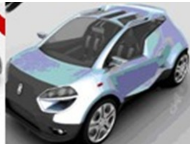
Fig6 Product design with WenZhou city flower and tree theme Fig7 Tourism product design with automobile production industry theme