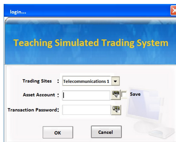
Fig.1. The login screen

2. Log in function. Before entering the online trading system, the customers have to log in firstly. The login screen is shown in Figure 1: