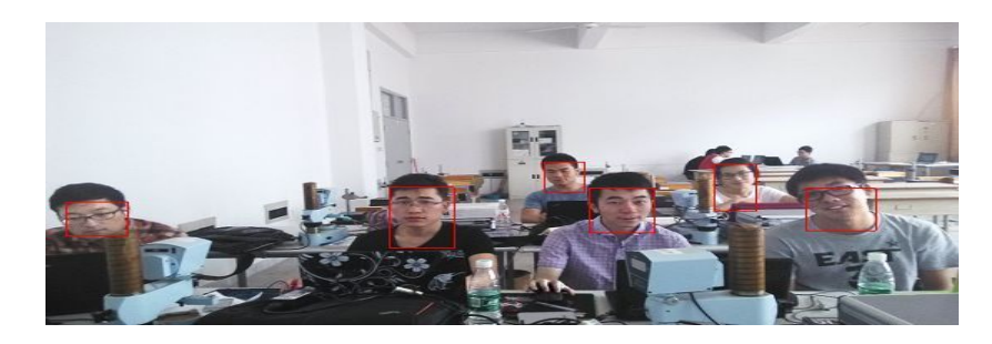
Fig. 8 the result of face detection