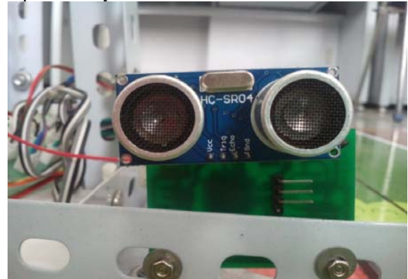
Fig.2. Physical picture of ultrasonic detector

controller can monitor crowd movements by monitoring the pins of body sensor.