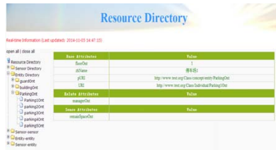
Figure 4 Resource Management Website

According to Resource Management Website (see in Figure 4), authenticated users can browse all the resources and details of them. Besides, they could do some operations such as creating, retrieve, updating and deleting based on their authority.