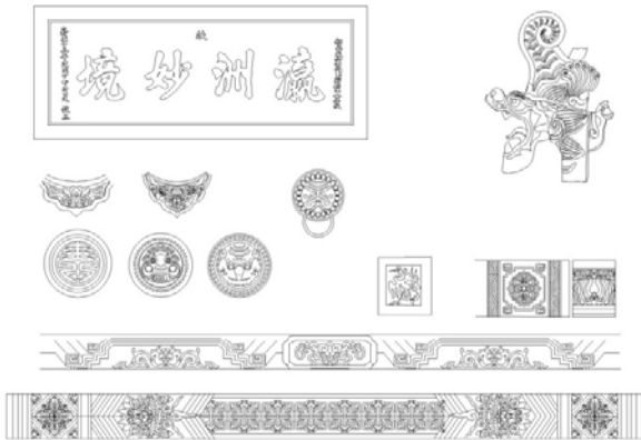
Figure 1. Detail drawing for the third courtyard of Chunyang Palace surveying

Surveying results mainly include plane graph, elevation, profile map, detail drawing and relevant auxiliary cultural relics.