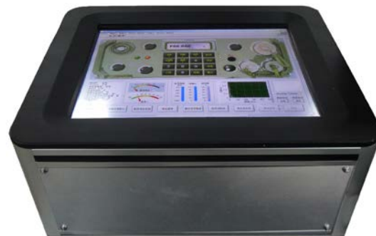
Fig.2 The appearance of the virtual communication equipment