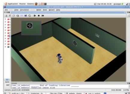
Figure 2: NAO and Virtual NAO Performing the Mission

The experiments we made aim at verifying the usability of the perception loop and the proposed software design methodology supporting that. Our aim is to create a software system able to control a robot by means of perception loops.