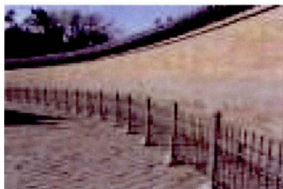
Figure (1) whispering

There are many ancient buildings of acoustic phenomena, which includes two acoustic phenomena: First, the structural components of the building to enhance the use of sound or produce an echo, the other is a homonym of applications. Beijing Tiantan whispering gallery is the clever use of the principles of sound propagation to achieve different wonderful effects. (Figure 1) whispering gallery and (2) a schematic diagram of the Temple of Heaven whispering sound waves.