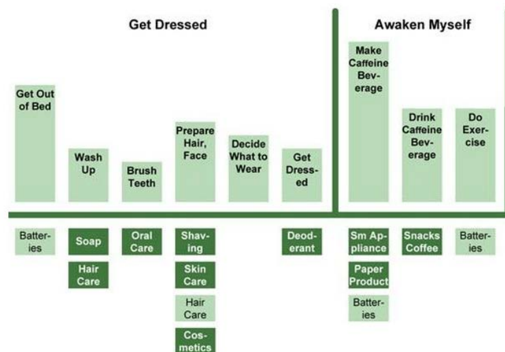
Fig. 1 Indi Young's Behavior Affinity Diagram

According to different areas and levels, the research methods of mental model are also different. Indi Young's definition of mental model is: people's motivation, thinking process, and the changing of feeling and thinking during the action. Indi Young argues that mental model can be shown with a series of Behavior Affinity Diagram. And the Behavior Affinity Diagram is a visualization way to show the dates of the target users' behaviors [7], as shown in Fig. 1. Above the horizontal axis, each part separated by the vertical axis (Get Dressed, Awaken Myself, etc.) is a mental space, and each mental space is divided into several parts. Under the horizontal axis, the product or product features are corresponding to each mental space. These two spaces (the space above and under the horizontal axis) constitute a complete mental model. And you can find some weaknesses of your product or product functions by comparing.