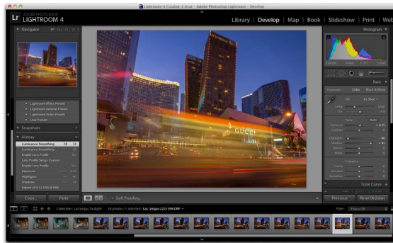
Figure 2. The applications of Lightroom

Lightroom has many similarities with Photoshop, but different positioning, won't be replaced, and Photoshop on many functions, such as the selection tool, photographs, defect correction, multiple file synthesis tools, the text tool and filter Lightroom does not provide. At the same time, the Windows version of the Lightroom has lost its Mac OS X version of some functions, such as slide background music, camera and memory card monitoring function, HTML slide creation tools, etc. Adobe, after acquisition of digital photo software company Pigmented Denmark ApS received the latter RawShooter software for digital camera, the workflow management, processing technology and so on have been integrated into the Windows version of Lightroom. Adobe officially released the Photoshop Lightroom 4 software, Lightroom 4 on the basis of the previous generation joined the books and maps module, provides the albums production and marking location, and other functions, and increase the support for video files [2]. Lightroom camera support, according to the different versions, and supported by the camera is different; Lightroom will be updated according to the camera, and constantly update their products software upgrades. Adobe Photoshop Lightroom can quickly import and processing management photos by the photographer in love, she is able to greatly improve the work efficiency of the photographer.