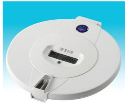
Figure 2. PivoTell Advance Dispenser.

The angle “noise” of the accelerometer is +/- 0.6 of a degree when stationary so the amount of rotation has to be greater than 2 degrees to reliably determine that the button was pushed. Any gross movement of the container will be picked up by both WISPs and hence will be cancelled out in the processing phase.