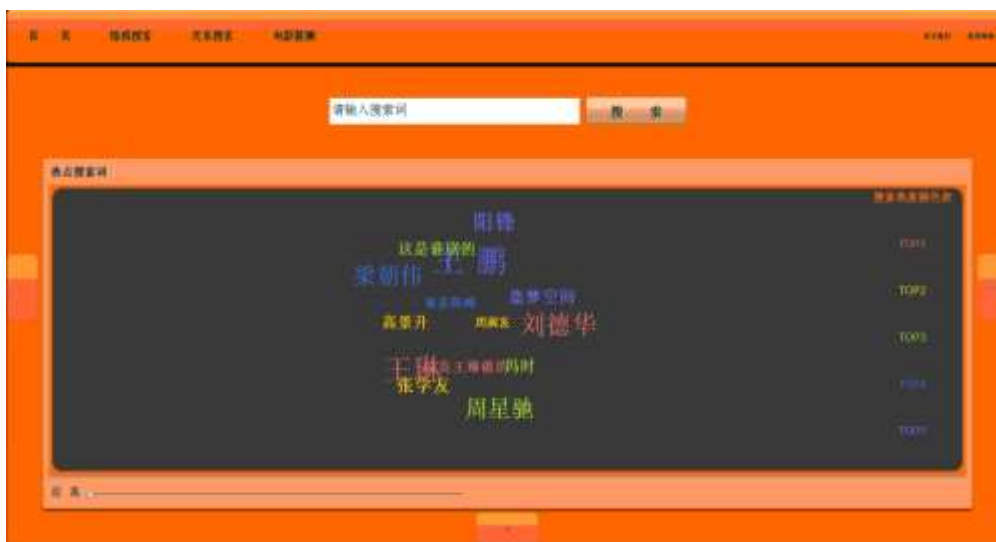
Figure 4. The sentiment search interface of iMovie