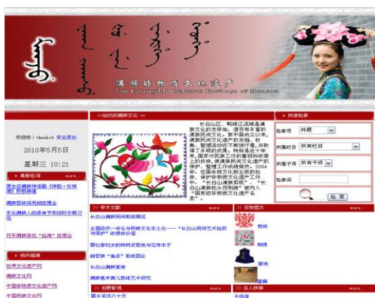
Figure 2. Manchu intangible cultural heritage digital protection platform

The effect of map (Manchu intangible cultural heritage digital protection platform as an example):