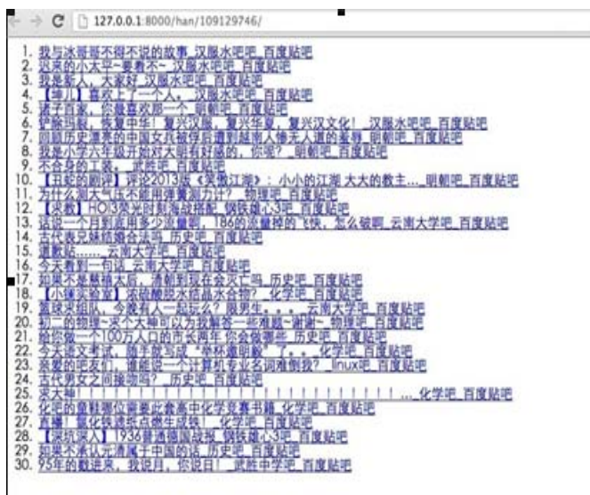
FIGURE II. THE RESULTS OF THE RECOMMENDATION SYSTEM

After using the algorithm model, the results of the recommendation system are shown in Figure 2.